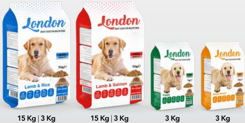
15 Kg | 3 Kg