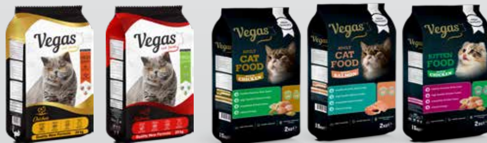
20 Kg | 10 Kg